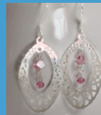
Fan of Love